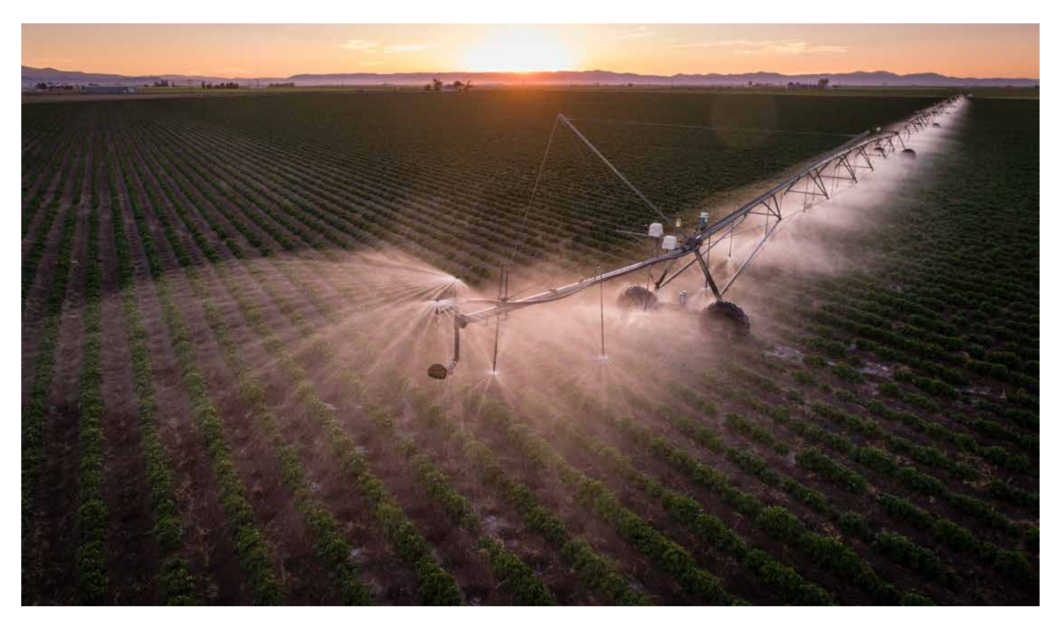
▲ Soybeans need well-drained, healthy soils to thrive.