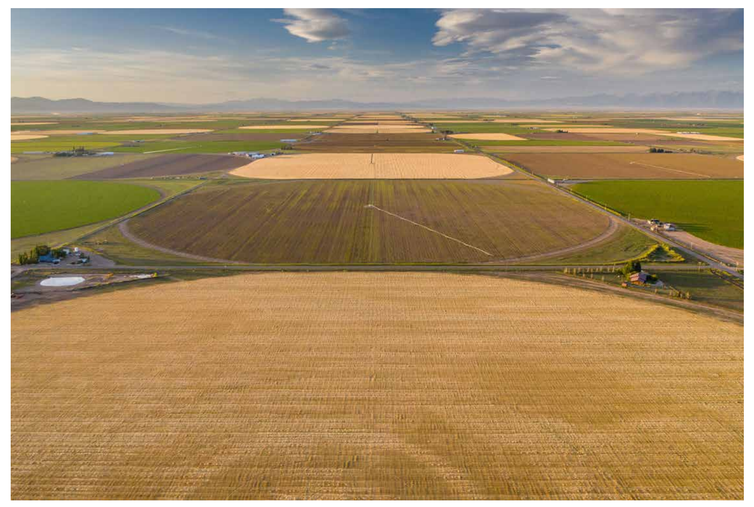
▲ How a farmer tills—or if they till at all—varies widely across the state.

Tillage practices across Colorado are as diverse as the types of crops farmers grow here. They tell the stories of how the land was cultivated over the centuries. Digging tools like the bison shoulder blades found by archaeologists suggest a gentle relationship between human and the earth — a turning of the hand and a turning of the dirt. The introduction of iron implements enabled harrowing, plowing, and cultivation of the places that once held vast forests and sprawling prairies.