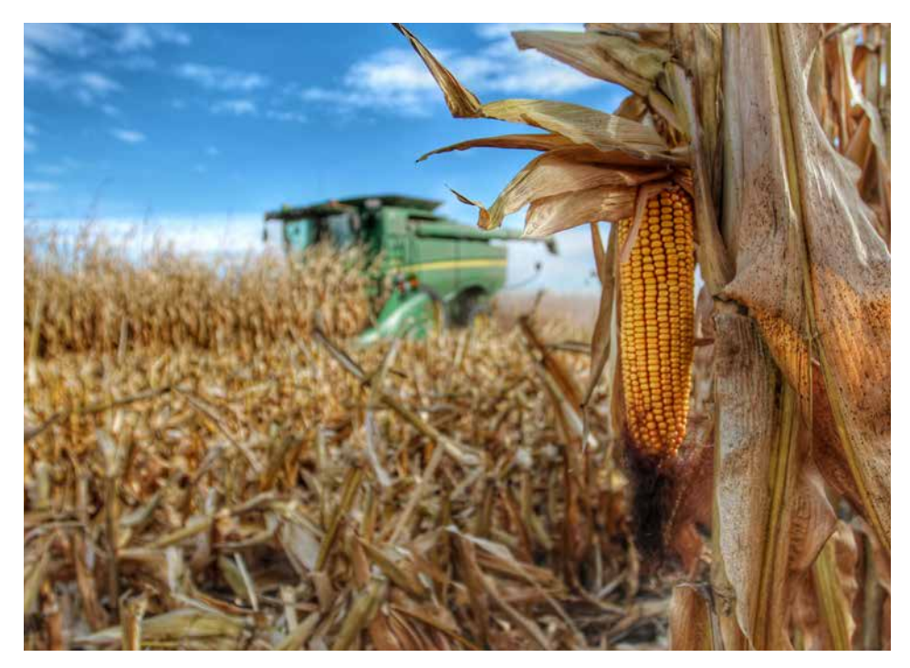
▲ After harvest, some farmers choose to till their fields; others may choose to leave stubble and crop residue in their fields and/or plant a cover crop.

This primer is about the benefits and challenges associated with implementing reduced tillage strategies. Many Colorado growers and land managers have adopted no-till practices in order to decrease soil erosion, fuel usage, and labor costs while simultaneously increasing soil moisture